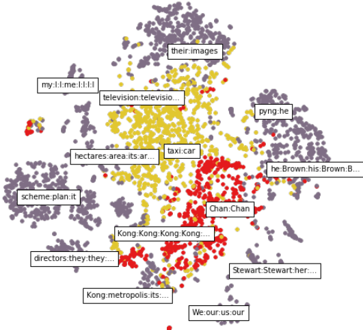
Figure 1: T-SNE visualization of learned entity representations on the CoNLL development set (best viewed in color). Each point shows a gold cluster of size > 1 . Yellow, red, and purple points represent predominantly common noun, proper noun, and pronoun clusters respectively. Captions show the head word of the mentions in a representative cluster.